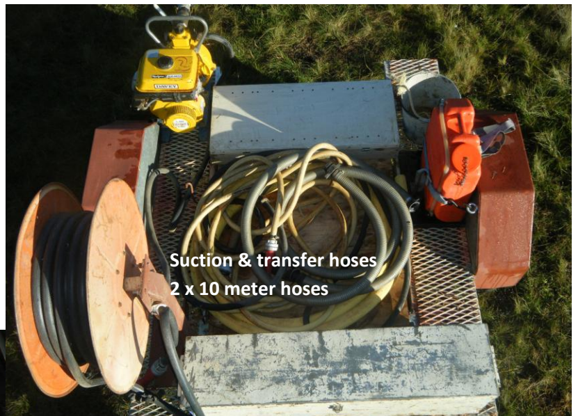
Suction & transfer hoses 2 x 10 meter hoses