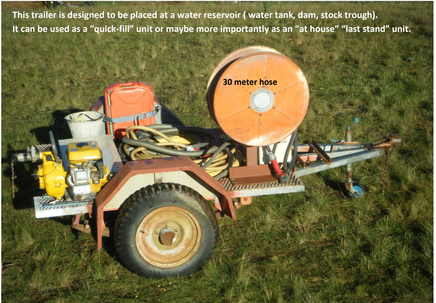
30 meter hose

This trailer is designed to be placed at a water reservoir ( water tank, dam, stock trough). It can be used as a “quick-fill” unit or maybe more importantly as an “at house” “last stand” unit.