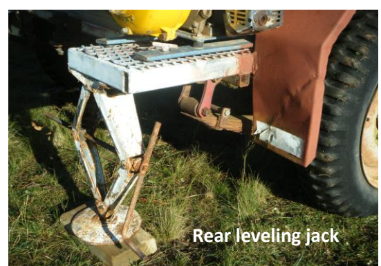
Rear leveling jack