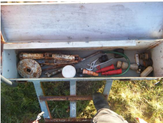
Tools, jack & hose connections