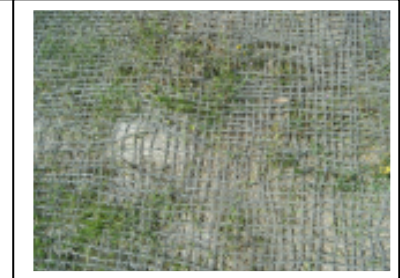
Shallower eroded area, terraced foot netting, before and eight months after.