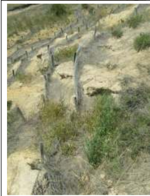
Upper deep erosion area eight months later