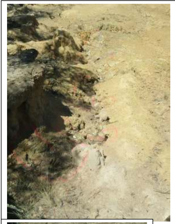
Upper area of deep erosion – Marking out & instalation